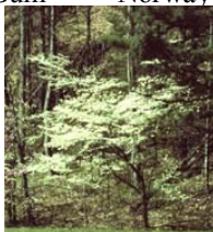
White Flowering Dogwood

Shade Trees: 1" caliper will be approximately 6-8' in height at planting. 2" caliper will be approximately 9'+ in height.