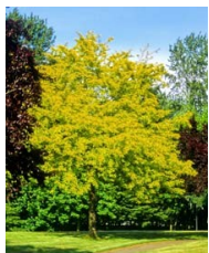
Thornless Honey Locust