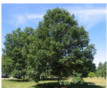
Swamp White Oak